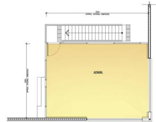
OFFICE 10 MEZZANINE PLAN SCALE: 1:50 @ B1

Proposed Office Warehouse Precision International